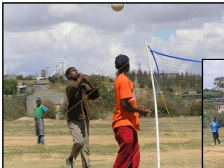
They had some fun playing football and volleyball.