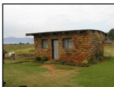
Ntate Musi's house, where we had dinner.

We also spent one night in Malealea, in the mountains of Lesotho. Here, we ate papa, nama le moroho (traditional basotho food), and met some of the local people.